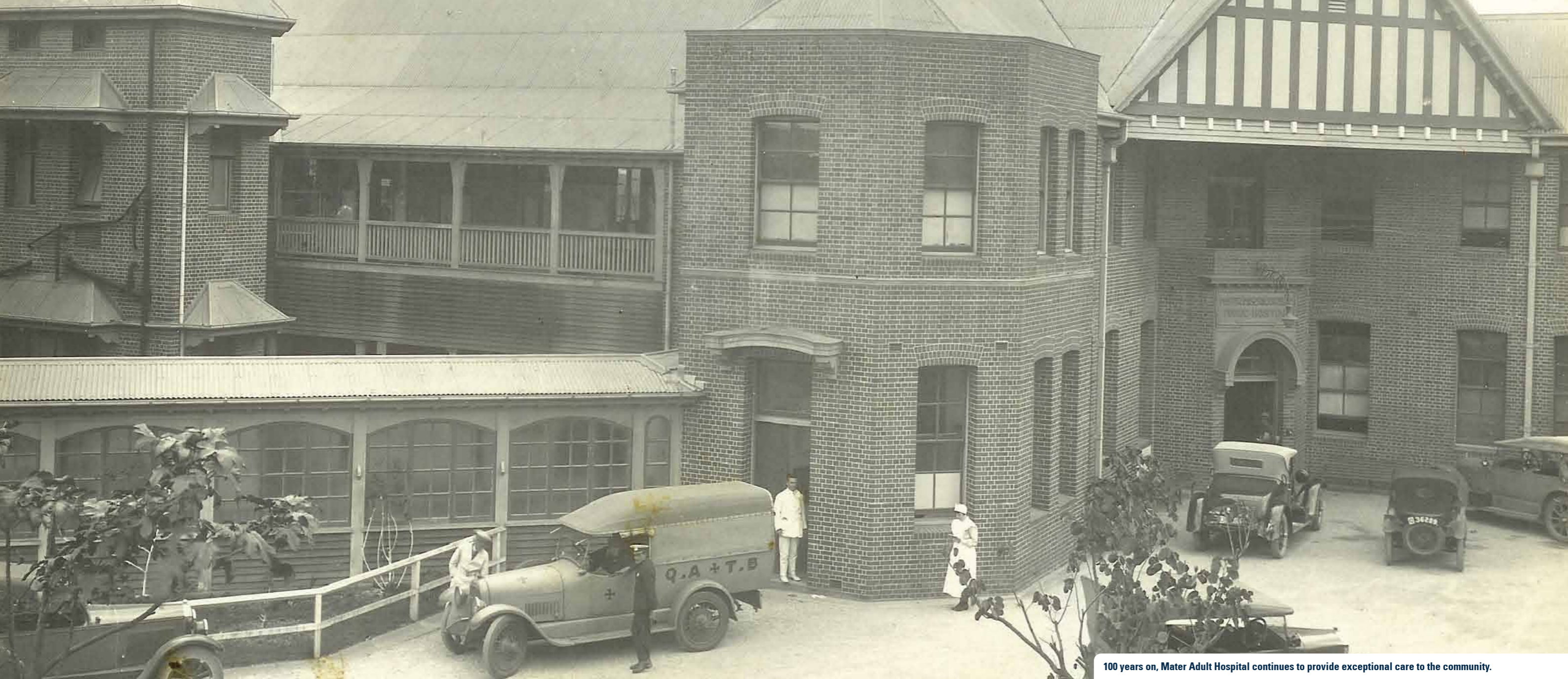
100 years on, Mater Adult Hospital continues to provide exceptional care to the community.