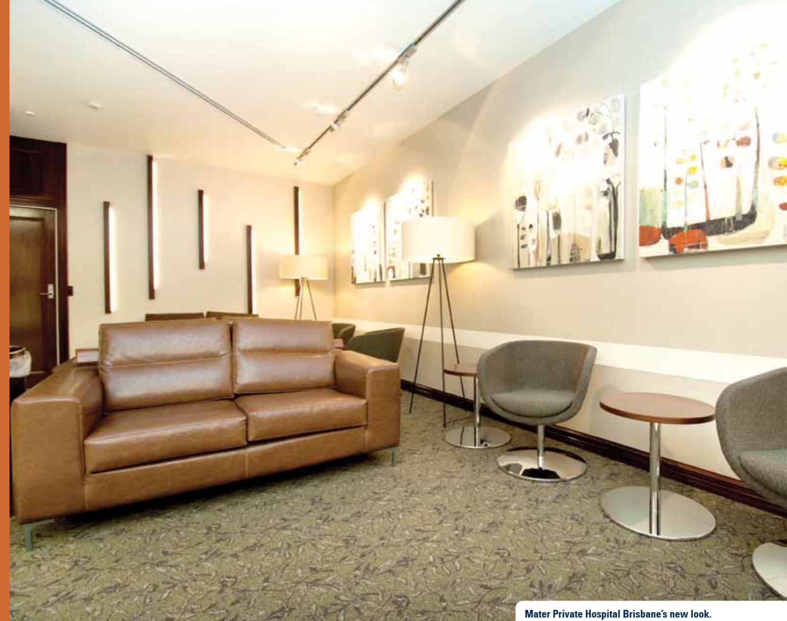
Mater Private Hospital Brisbane's new look.

For more information about Mater Pathology visit pathology.mater.org.au