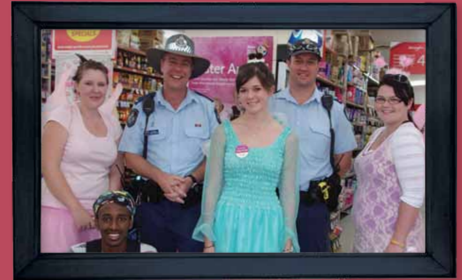
IGA Narangba dress up for Mater little Miracles Easter Appeal.