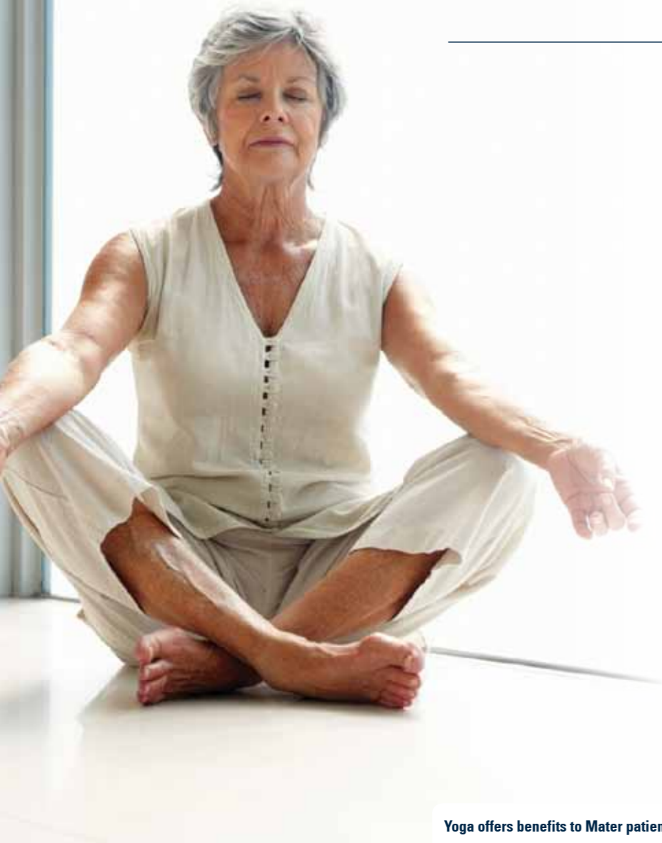
Yoga offers benefits to Mater patients.

Mater cares for people. Taking a holistic approach to health, our care extends past treatment and we're constantly looking to improve the quality of life for our patients—which can come in many and often unlikely forms.