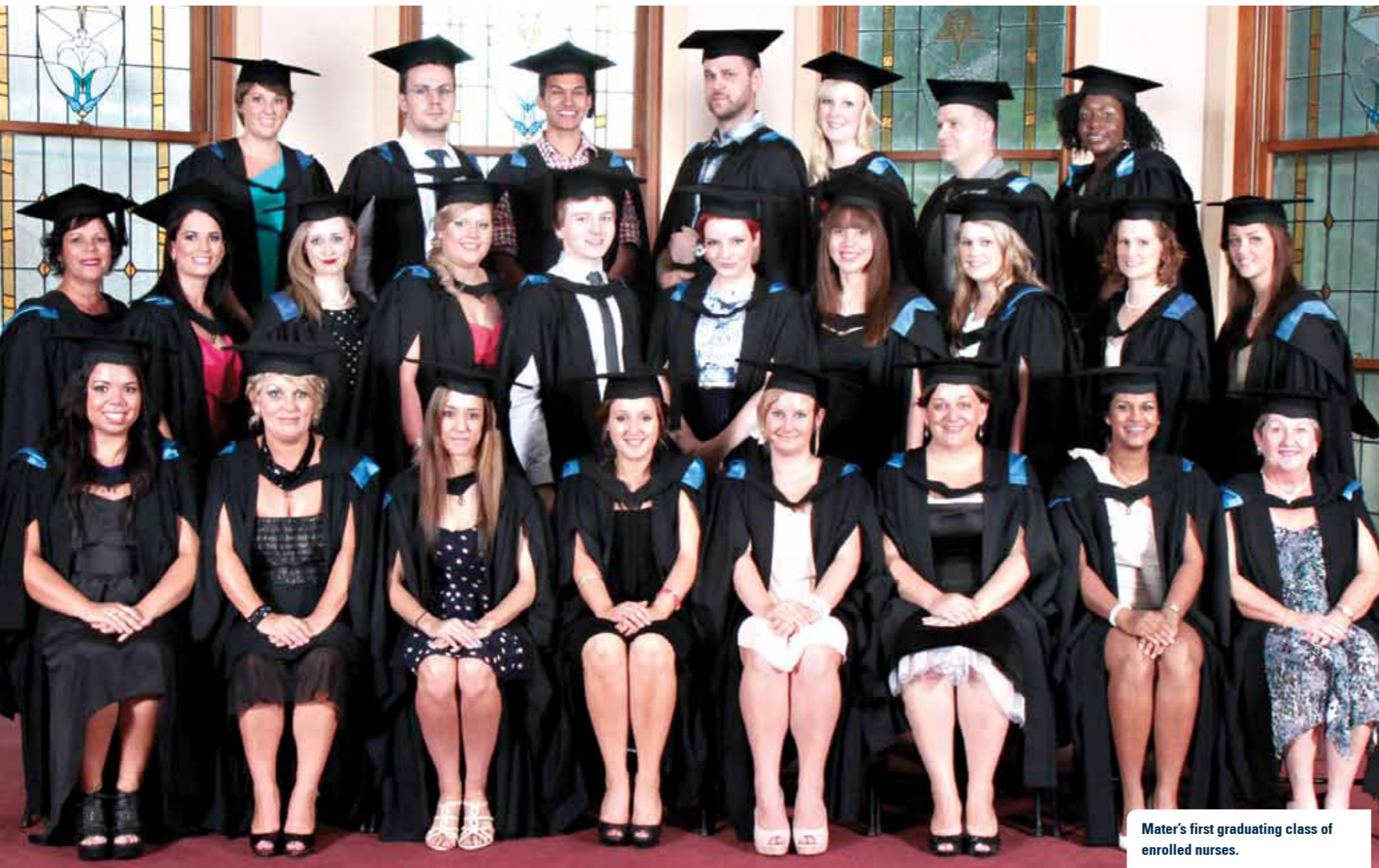
Mater's first graduating class of enrolled nurses.