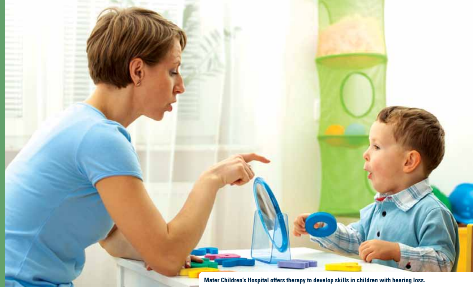
Mater Children's Hospital offers therapy to develop skills in children with hearing loss.

The Churchill Trust was set up in 1965 following the death of Sir Winston Churchill, to commemorate and honour his memory. To this day the trust stands as Australia's largest public fundraising appeal—raising more than $4.3 million in a single day.