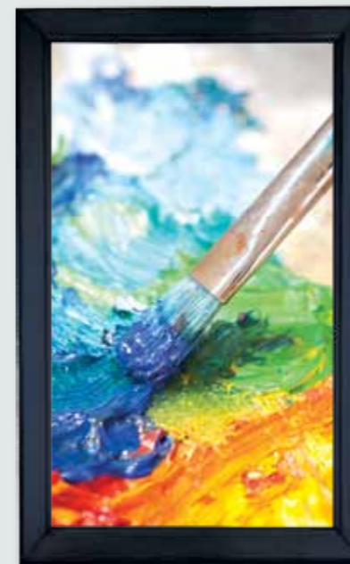
Mater offers art therapy classes to help patients find focus and enjoyment through art.

For the past few years the national fundraising initiative 'Dry July' has selected Mater as one of its Queensland beneficiaries, providing hundreds of thousands of dollars to assist cancer patients each year.