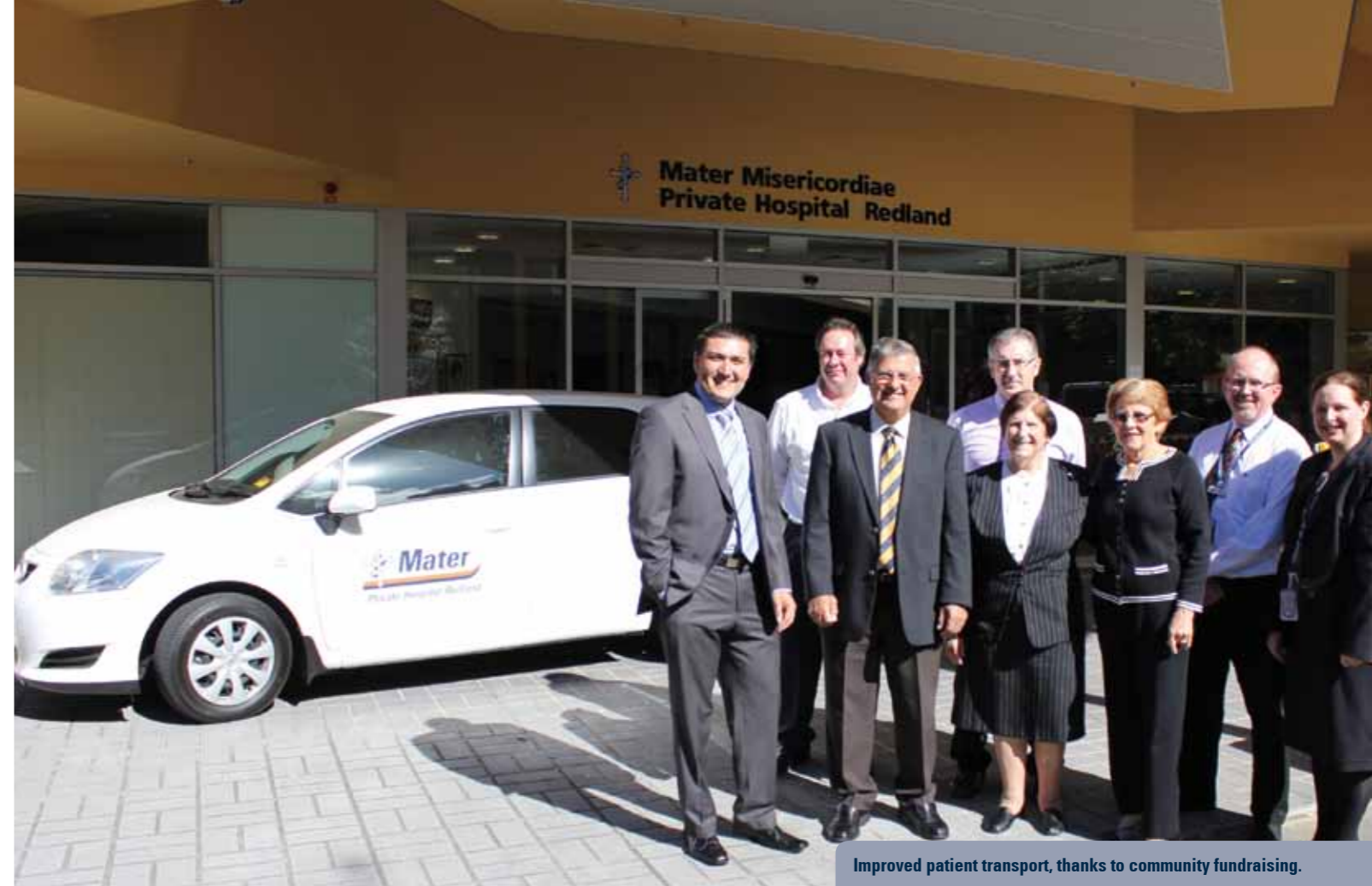
Improved patient transport, thanks to community fundraising.

The weekly sessions, funded by Mater chicks in pink program, are available to all breast cancer patients irrespective of where they were treated.