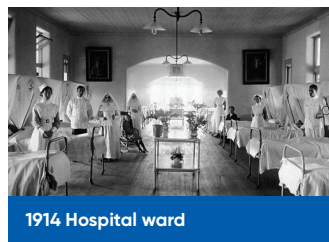
1914 Hospital ward