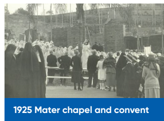
1925 Mater chapel and convent