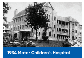
1934 Mater Children's Hospital