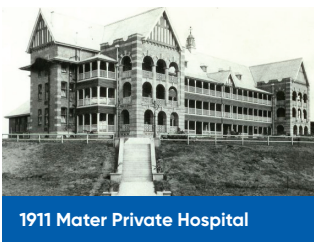
1911 Mater Private Hospital

Mater will honour its heritage by acknowledging and sharing the history of Mater Hill and ensuring stronger connections through built form to our founders, the Sisters of Mercy, as well as Aboriginal and Torres Strait Islander People, the community and our own Mater stories. Mater proposes to reinvigorate iconic buildings and establish inclusive, community focused green spaces for all to enjoy.