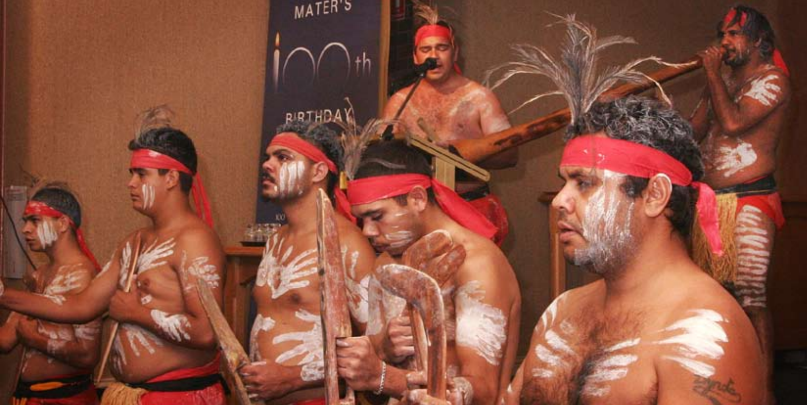
Above: The Nunukul Yuggera Aboriginal Dance Troupe performed at the indigenous ceremony.