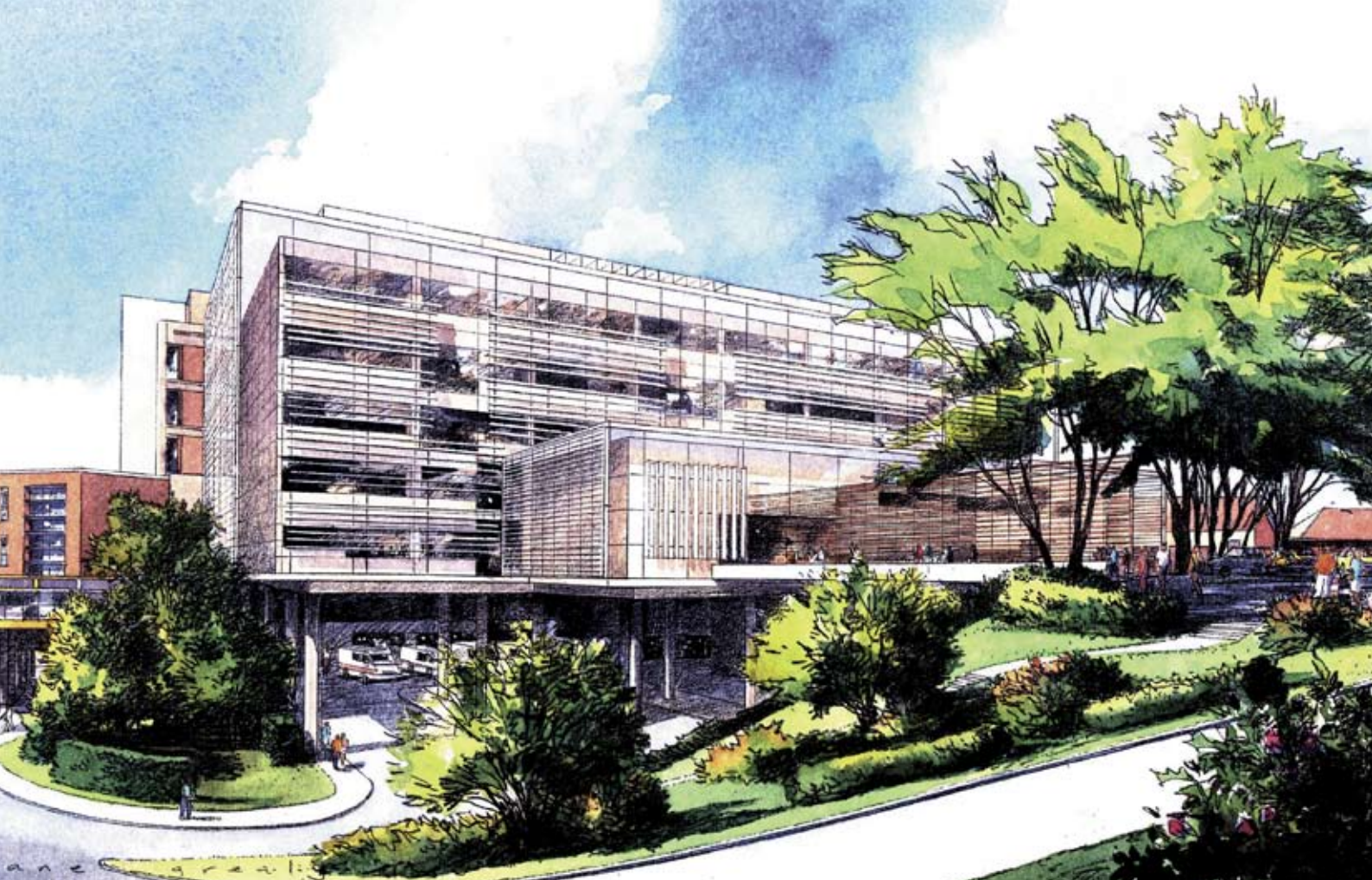
Architect's impression of the new Mater Mothers' Hospital

The new Mater Mothers' will provide integrated services for women including, Tertiary Obstetrics, Tertiary Gynaecology, Tertiary Neonatal Services, Maternal Fetal Medicine, Obstetric Medicine, Perinatal Outreach Education and Midwifery Practice.