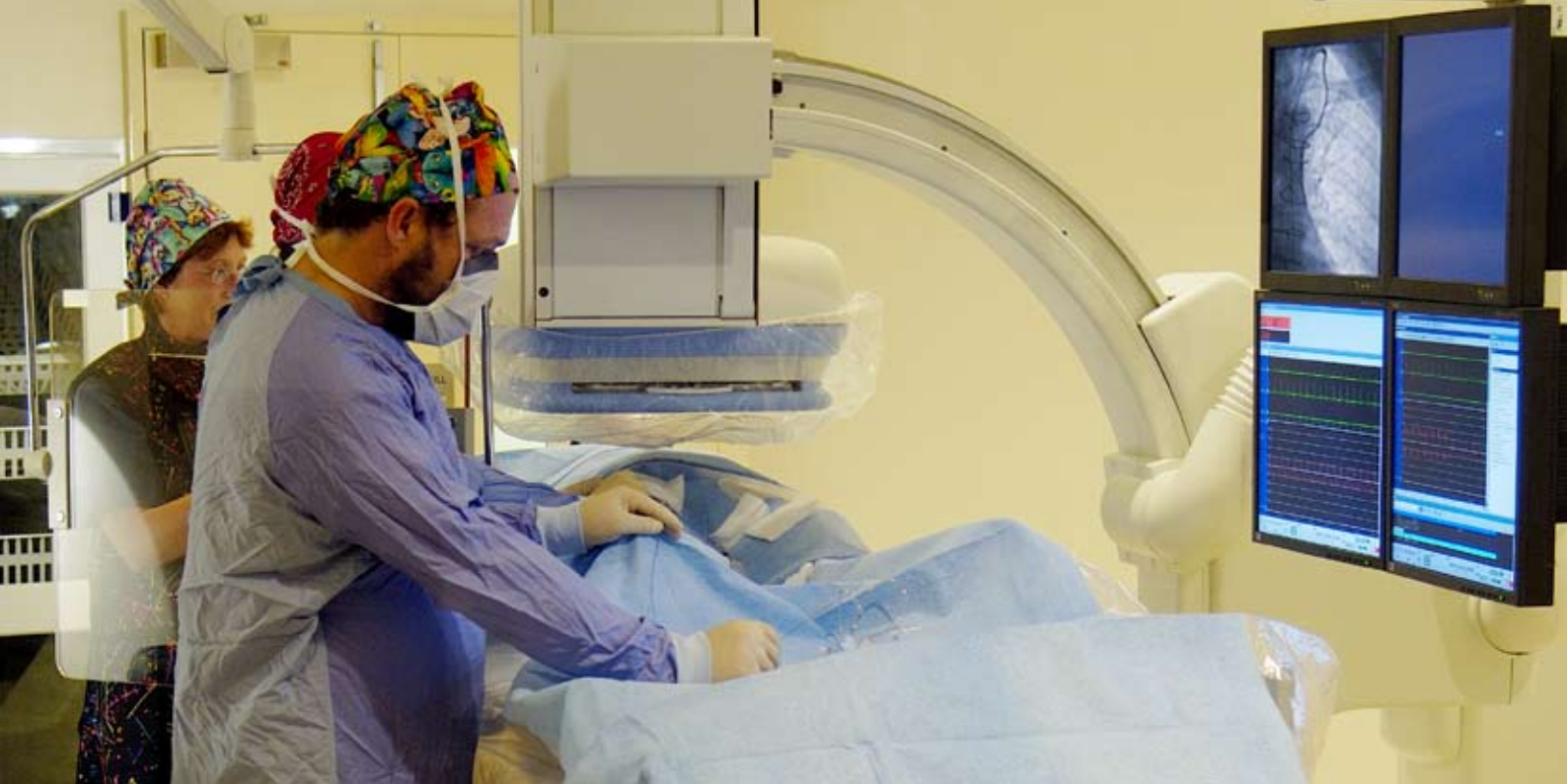
Above: The new Mater Private Hospital CardioVascular Unit.