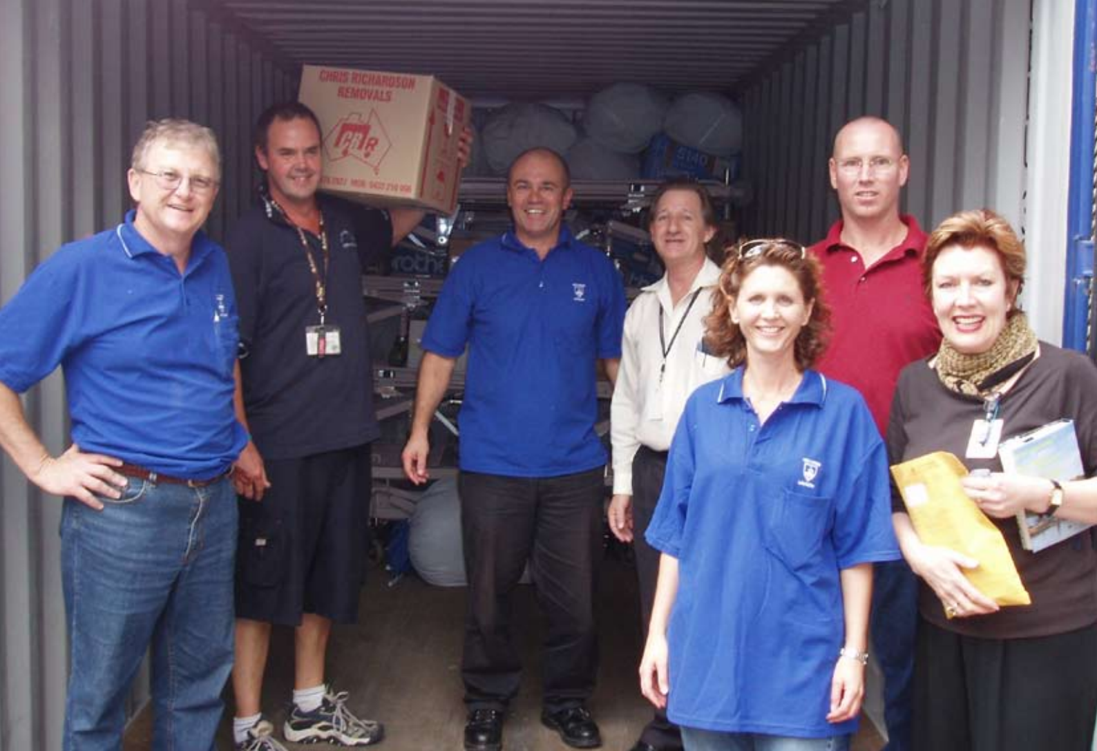
Above: Mater staff load a container of supplies bound for Wewak.