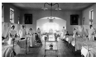
1914 Hospital ward