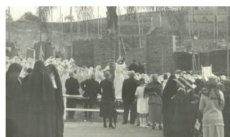
1925 Mater chapel and convent