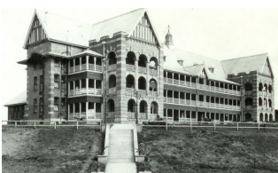
1911 Private hospital

Mater will honour its heritage by acknowledging and sharing the history of Mater Hill and ensuring stronger connections through built form to the Sisters of Mercy, Aboriginal and Torres Strait Islander People, the community and our own Mater stories. Mater proposes to reinvigorate iconic buildings and establish an inclusive green space surrounding Aubigny Place for all to enjoy.