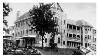
1934 Mater Children's