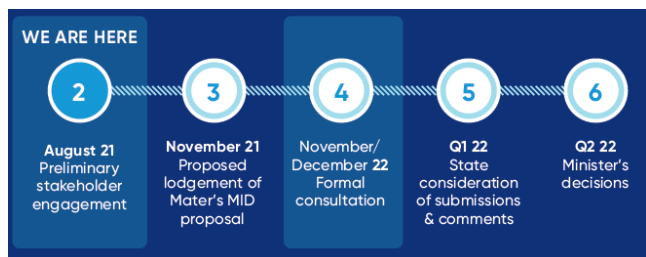
Mater MID Timeline

The MID process includes input from the relevant council and surrounding community and considers the range of potential impacts that might arise such as traffic and impacts on amenity.