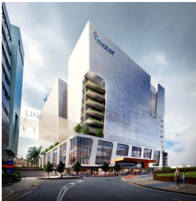
Image: Artist's impression of a potential new Clinical Services Building. This may not be the final design.

Mater has received development approval from Brisbane City Council for the redevelopment of the Convent. Works have commenced. Timeframes for the other buildings are yet to be developed. Further advice will be provided before projects commence.