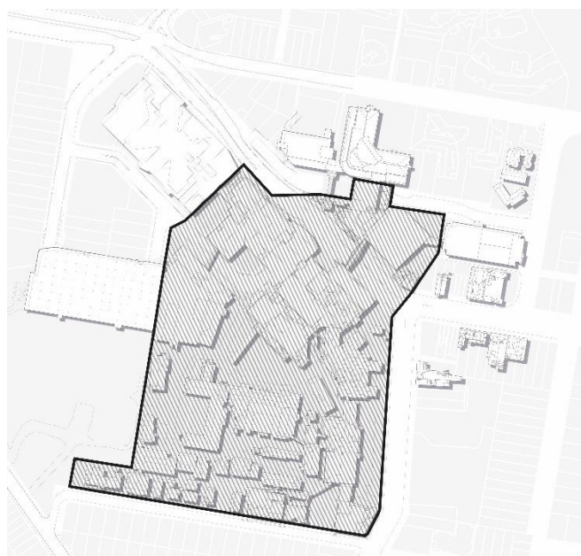
Proposed Mater MID Boundary

The proposed MID boundary for Mater Hill is shown below. Please note that not all properties within this boundary are owned by Mater.