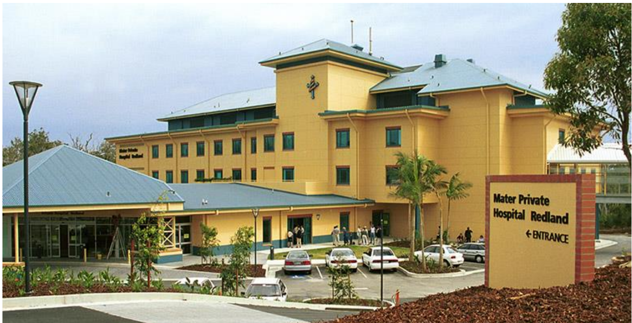
Mater Private Hospital, Redland Campus