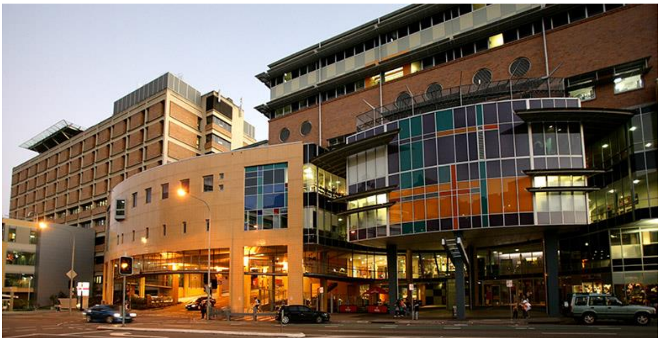
Mater Children's Private, South Brisbane Campus