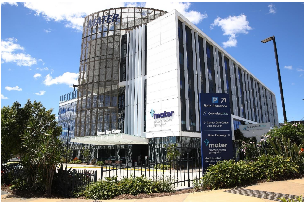
Mater Private Hospital, Springfield Campus