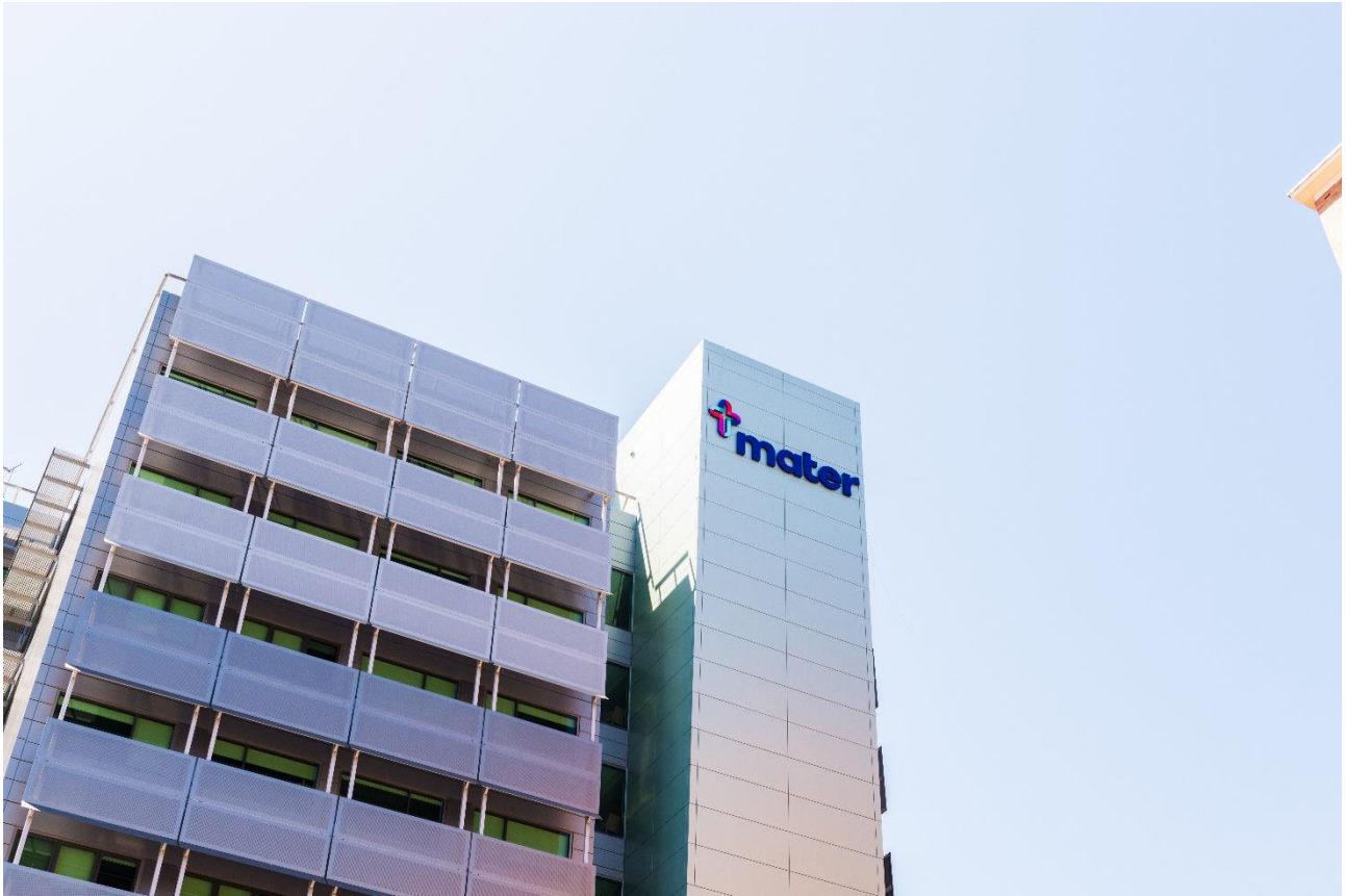
Mater Mothers Hospital, South Brisbane Campus